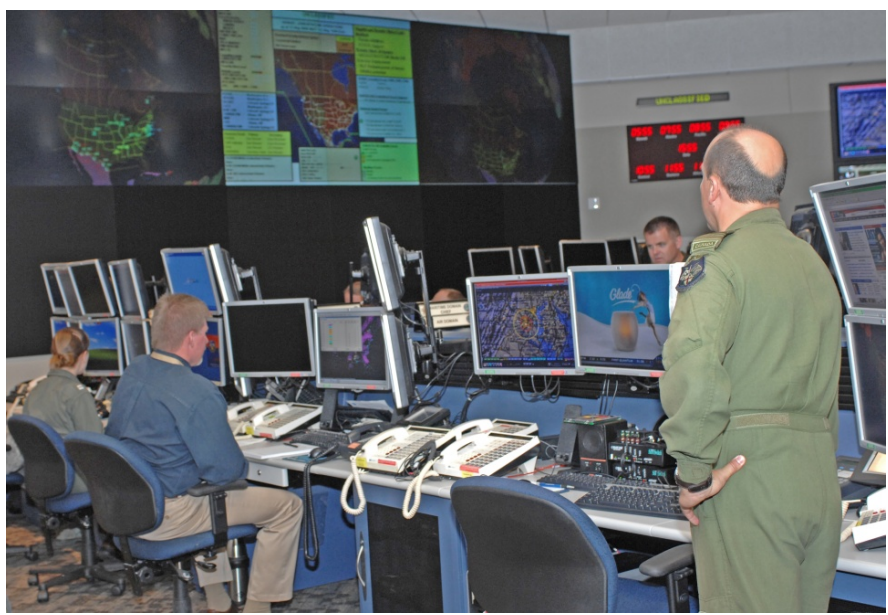
The NORAD and USNORTHCOM Command Center, May 2008.

defense and political leaders have therefore maintained the conviction that, for the foreseeable future, their common defense was best guaranteed by continued mutual cooperation.