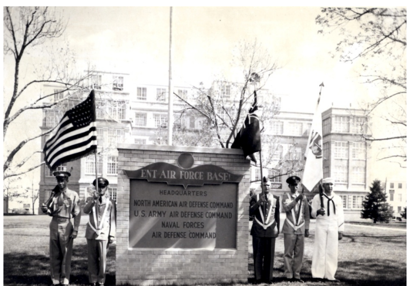
Headquarters, North American Defense Command, Ent AFB, Colorado Springs, CO.

With the beginning of the Cold War, American defense experts and political leaders began planning and implementing a defensive air shield, which they believed was necessary to defend against a possible attack by long-range, manned Soviet bombers. By the time of its creation in 1947, as a separate service, it was widely acknowledged the Air Force would be the center point of this defensive effort. Under the auspices of the Air Defense Command (ADC), first created in 1948, and reconstituted in 1951 at Ent AFB, Colorado, subordinate Air Force commands were given responsibility to protect the various regions of the United States. By 1954, as concerns about Soviet capabilities became more grave, a multi-service unified command was created, involving Naval, Army, and Air Force units—the Continental Air Defense Command (CONAD). Air Force leaders, most notably Generals Benjamin Chidlaw and Earle Partridge, guided the planning and programs during the mid 1950s. The Air Force provided the interceptor aircraft and planned the upgrades needed over the years. The Air Force also developed and operated the extensive early warning radar sites and systems which acted as "trip wire" against air attack. The advance warning systems and communication requirements to provide the alert time needed, as well as command and control of forces, became primarily an Air Force contribution, a trend which continued into the future as the nation's aerospace defense matured.