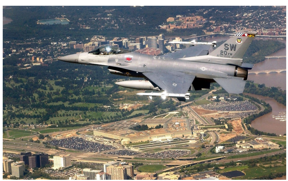
NORAD F-16 aircraft flies over the Pentagon in NOBLE EAGLE mission defending the homeland after 9/11.

Operation Noble Eagle response has become institutionalized into daily plans and NORAD exercises through which the command ensures its capability to respond rapidly to airborne threats. USAF units of NORAD have also assumed the mission of the integrated air defense of the National Capital Region, providing ongoing protection for Washington, D.C. Also, as required, NORAD forces have played a critical role in air defense support for National Special Security Events, such as air protection for the NASA shuttle launches, G8 summit meetings, and even Superbowl football events.