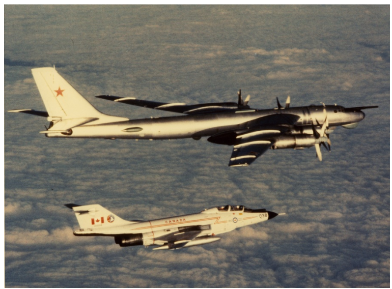
Canadian CF-101 Voodoo intercepts Russian TU-95 Bear Bomber flying near the North American airspace buffer zone.

Within one year of its establishment, NORAD began the process of adapting its missions and functions to "a new and more dangerous threat." During the 1960s and 1970s, the USSR focused on creating intercontinental and sea-launched ballistic missiles and developed an antisatellite capability. The northern radar-warning networks could, as one observer expressed it, ". . not only [be] outflanked but literally jumped over." In response, the USAF built a space-surveillance and missile-warning system to provide worldwide space detection and tracking and to classify activity and objects in space. When these systems became operational during the early 1960s, they came under the control of the NORAD.